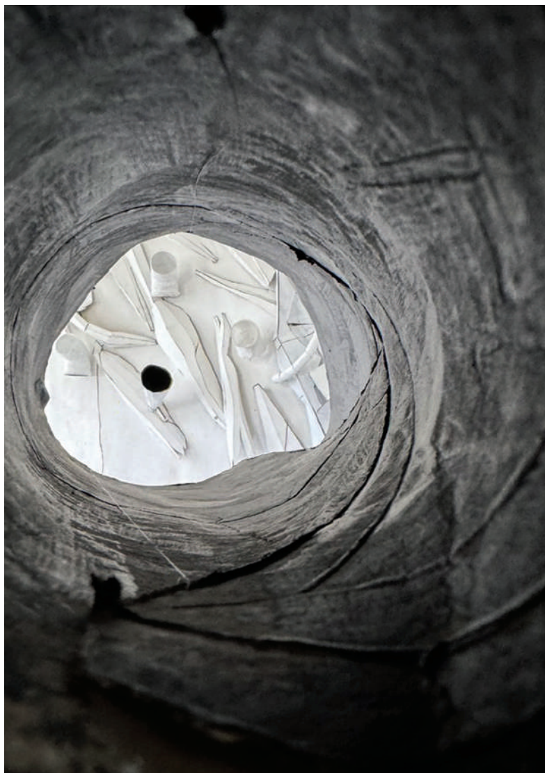
CHASM (DETAIL), 2026 CARDBOARD, AUDIO, SENSORS, ELECTRONICS, VIDEO PROJECTION, 213 x 365 cm