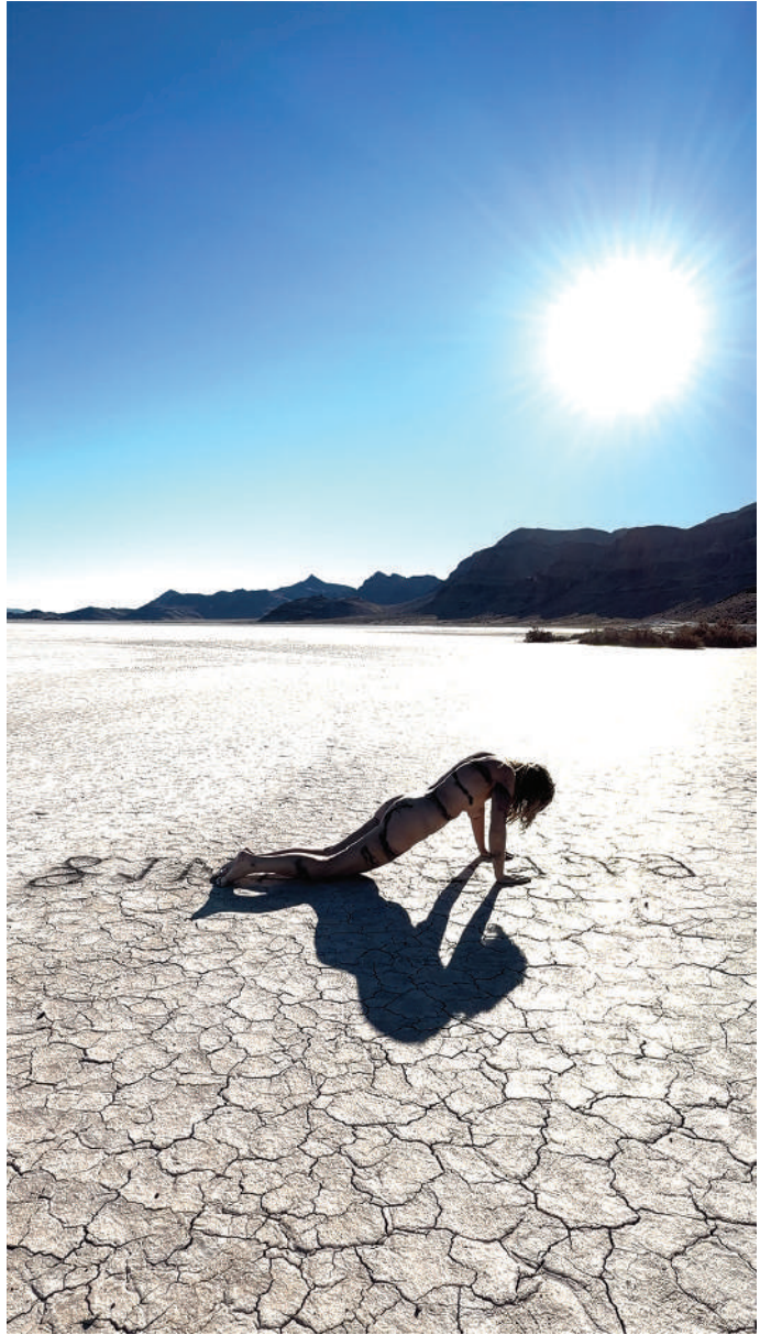
UNTITLED (2025) VIDEO STILL