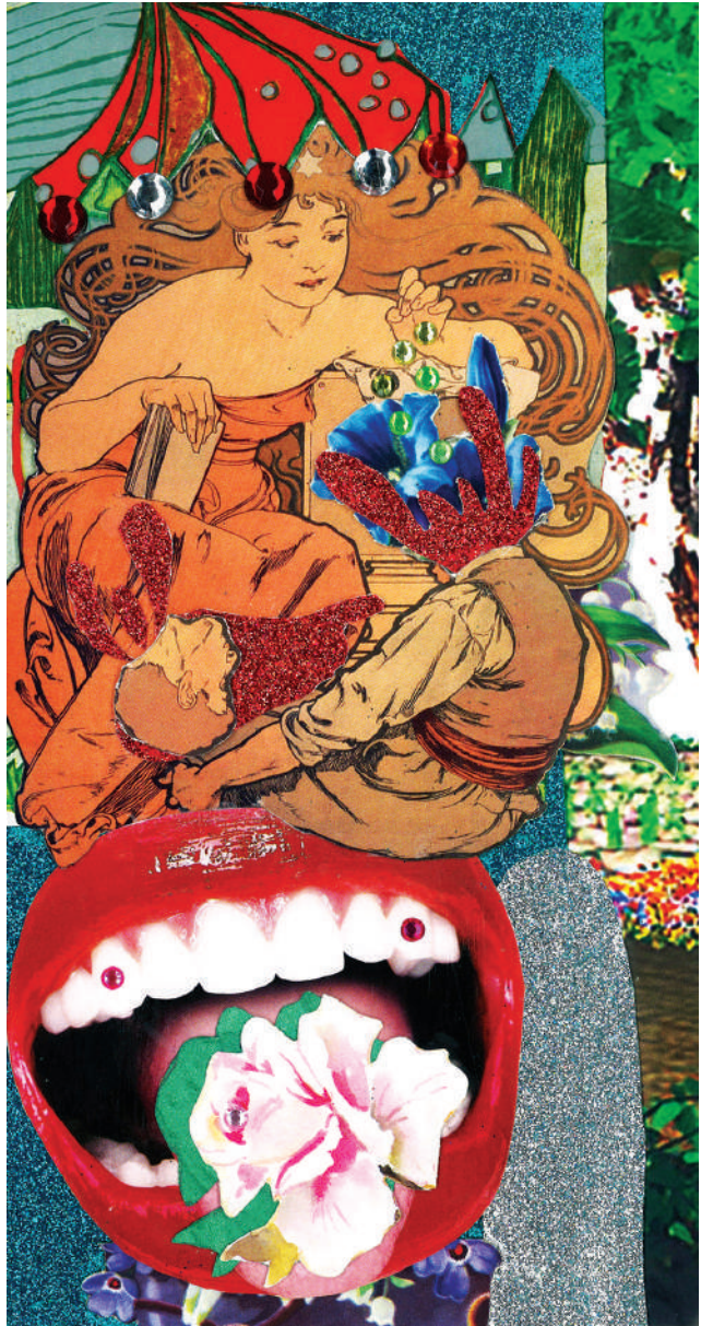
UNTITLED (VENUSIAN), 2026

COLLAGE OF PAPER, FABRIC, AND RHINESTONES, 23 x 12 cm