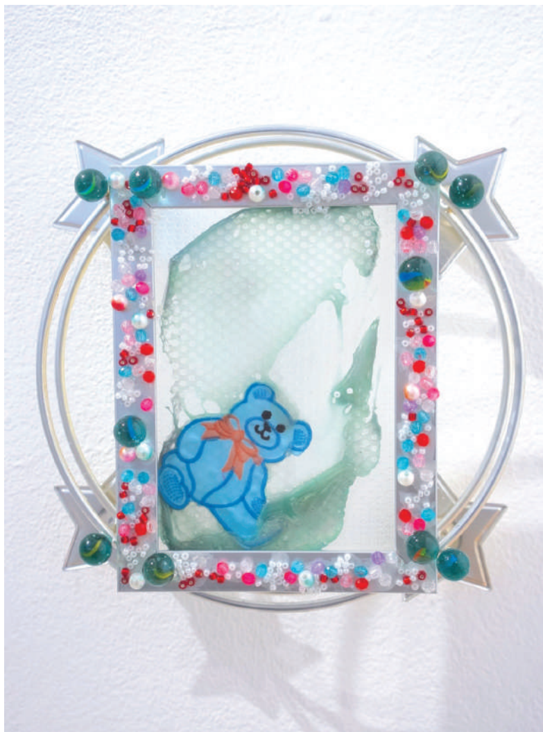
MEMORIA ORBIT, 2026 INSTALLATION, MARBLES, PONY BEAD, SLIME, STAINLESS STEEL, 23 x 23 cm