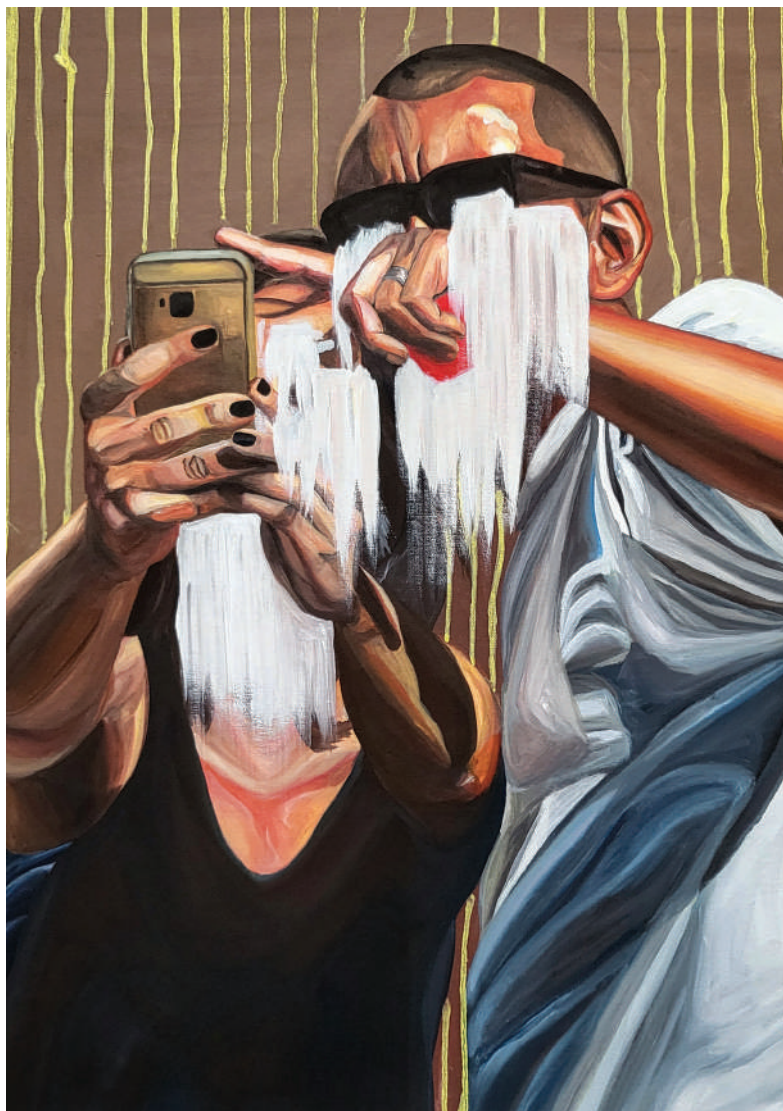
WATCHING AT OUR LIVES (DETAIL), 2025