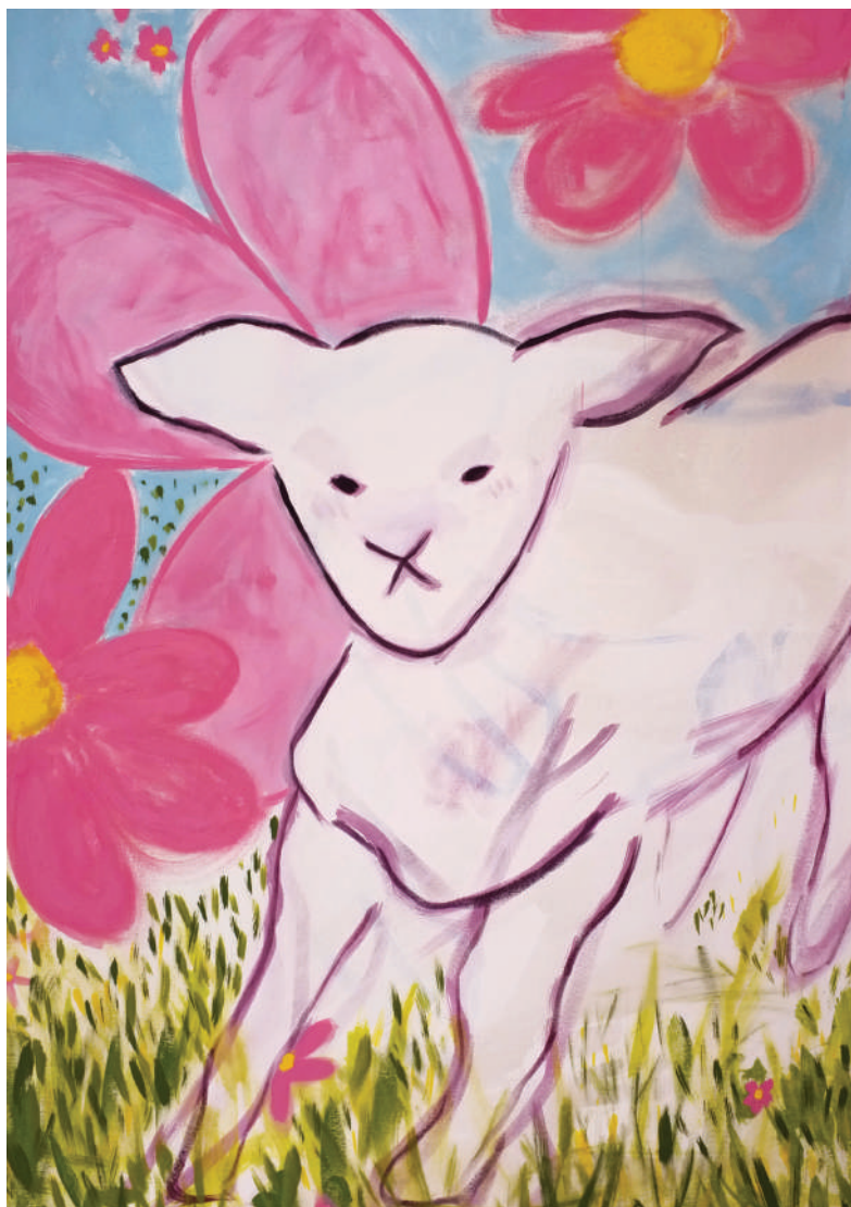
I LOVE TO PLAY YOU LOVE TO EAT ME, 2026