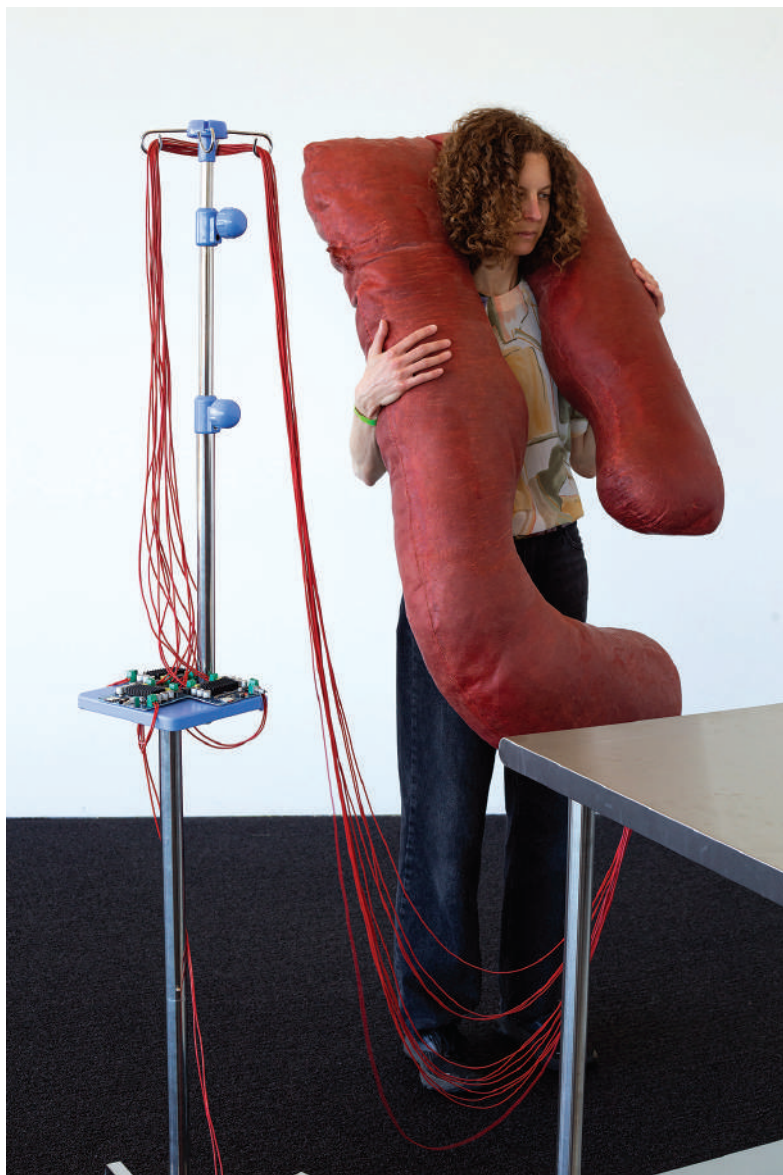
SONIC INHERITANCE, 2026 BODY ORGAN, TRANSDUCERS, WOOL, LATEX, SEVEN TUMOR COMPOSITIONS