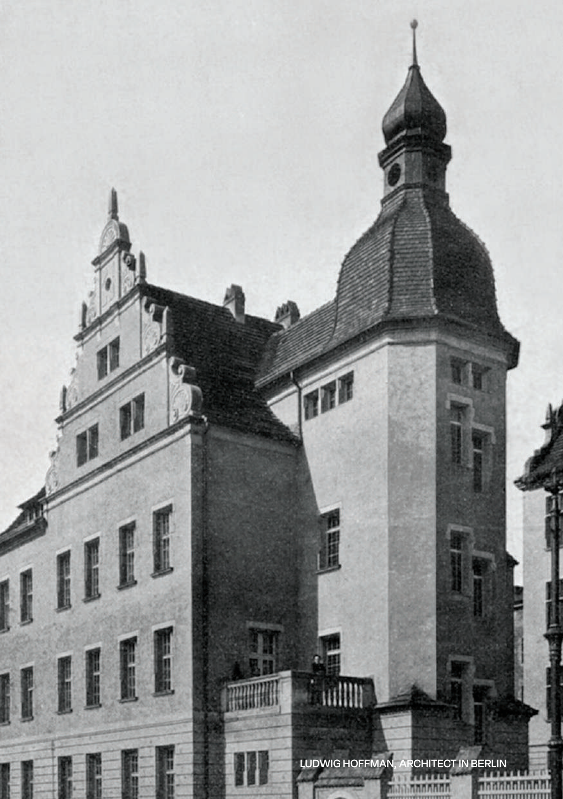
LUDWIG HOFFMAN, ARCHITECT IN BERLIN