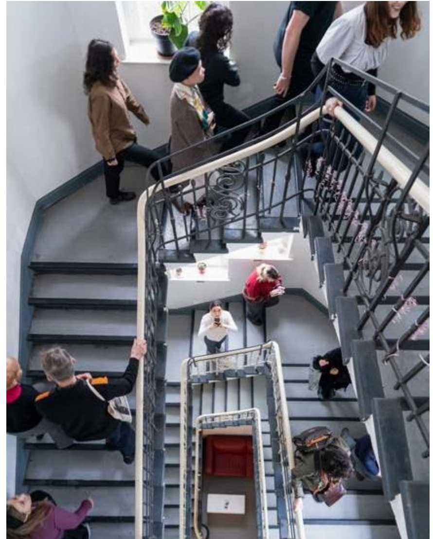
Studio Visits with SomoS Berlin, February 2024

What's On is our weekly newsletter shared with the artists keeping them informed of openings, events, workshops, and open calls.