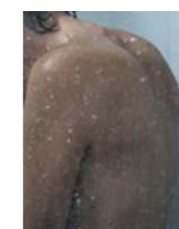
Emal Dubsik (Switzerland and Romania)