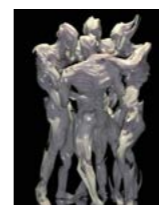
Flávio Malaguti (Brazil)