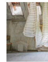
Moksha Richards (Australia and Germany)