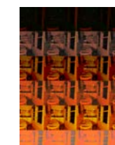
Fahsai Chainarong (Thailand)