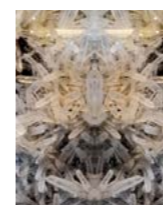
Rafal Wysocki (Poland)