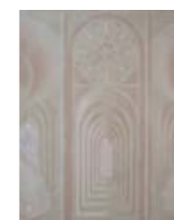
Suyi Xu (China)