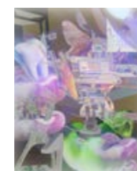
Jiatong Yao (China)