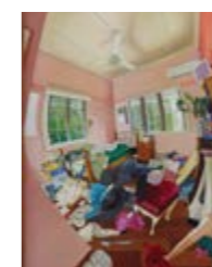
Toyah Robinson (Australia)