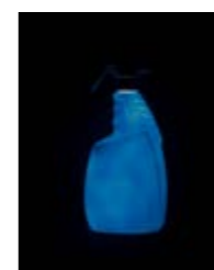
Lorenzo Ballerini (Italy)