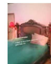
Lotte Louise de Jong (Netherlands)