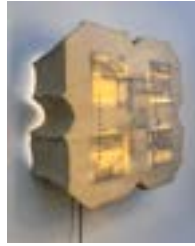
Bakerbrew (United States of America)