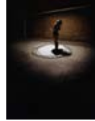
Getsay (United States of America)