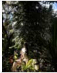
Dae (United States of America)