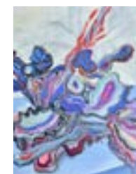
Yulia Ani (Germany)