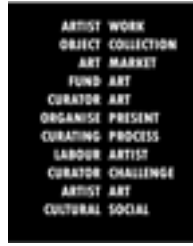
Bianca Durrant (Australia)