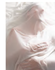
Carlotta Proietto (Italy)