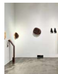
Rosa Park (United States of America)