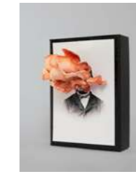
Sophie Gabrielle (Australia)