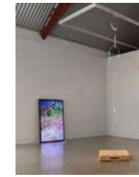
Sally Craven (Australia)