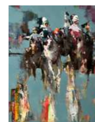
Rashid Kulbatyrov (Kazakhstan)