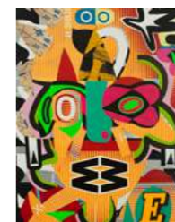
Esteban Patino (Colombia)