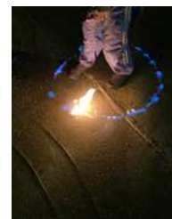
Osamu Shikichi (Japan)