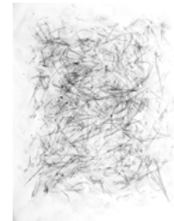
Gonzalo Morales Leiva (Chile)