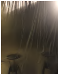
Laura Mirarchi (Italy)