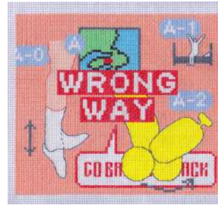
Chae Won Moon (South Korea)