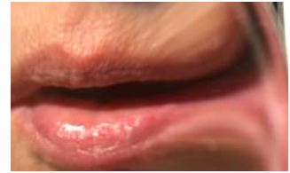
Charity Be (United States)