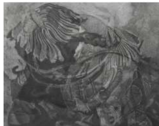
Roxy Richens (Australia)