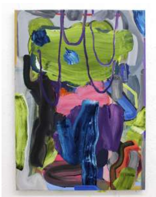
Sinéad Aldridge (Ireland)