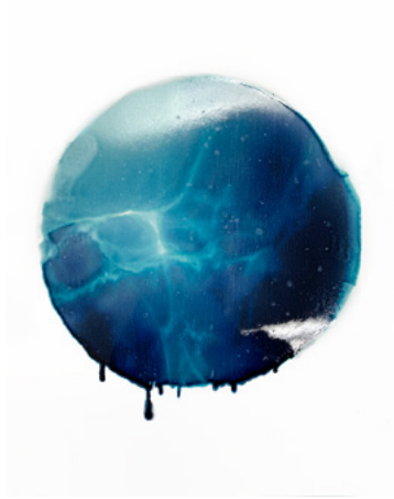
Adi Oz-Ari (Israel)